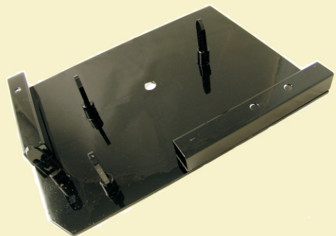
Hard Standing Plate