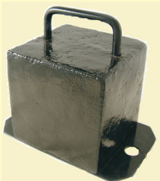
25kg Base Weights - Optional

Note: Value Hard Standing Kits do not include Groundrails or Link bars