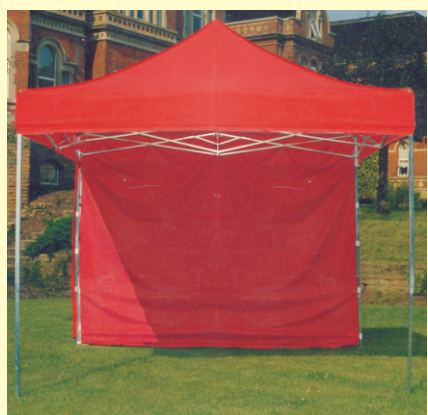
Value 3.0m x 3.0m