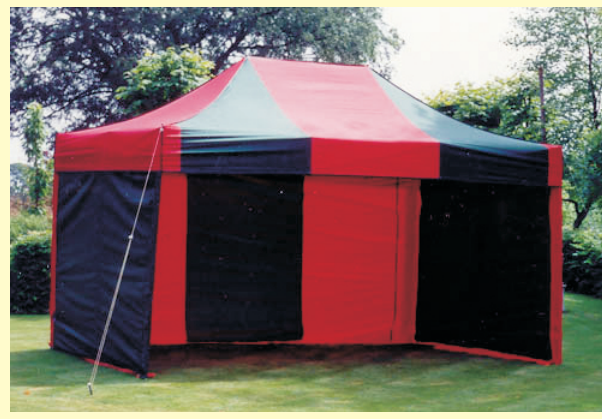
Classic 3.0m x 4.5m